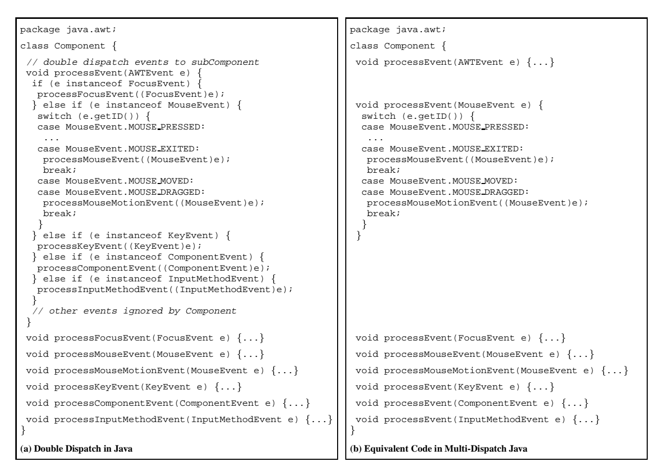
Figure 2: Double vs. Multi-Dispatch in Java

into the selector (e.g. fireInternalEvent()). Despite the limitations this imposes on the programmer, it is clear that double dispatch is still the standard technique in Swing as well.