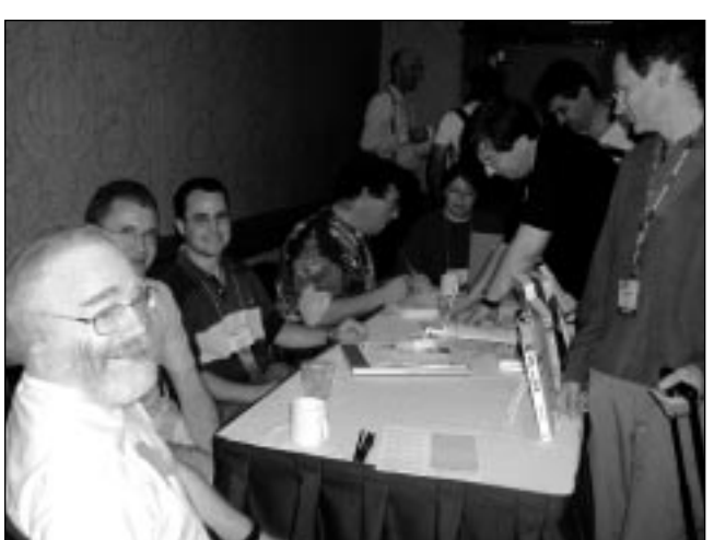
A book-signing party

Scott Crosby pointed out that algorithms have best-case, normal-case, and worst-case behaviors. When we implement algorithms, we rely on normalcase behavior. A system with malicious users may be forced to demonstrate worst-case behavior.