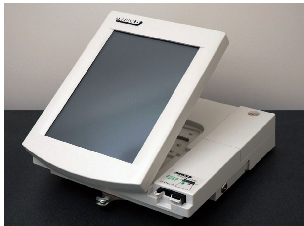
Figure 1: The Diebold AccuVote-TS voting machine

This paper reports on our study of an AccuVote-TS, which we obtained from a private party. We analyzed the machine’s hardware and software, performed experiments on it, and considered whether real election practices would leave it suitably secure. We found that the machine is vulnerable to a number of extremely serious attacks that undermine the accuracy and credibility of the vote counts it produces.