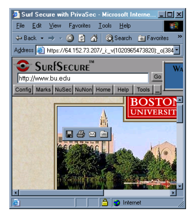
Figure 4: PrivaSec screen shot showing SafeWeb technology. The top frame is a control panel ("SurfSecure"), and the bottom frame is the page requested by the user.

(The examples in this section refer to PrivaSec's deployed service; therefore, the URLs use PrivaSec's IP address 64.152.73.207 rather than safeweb.com.)