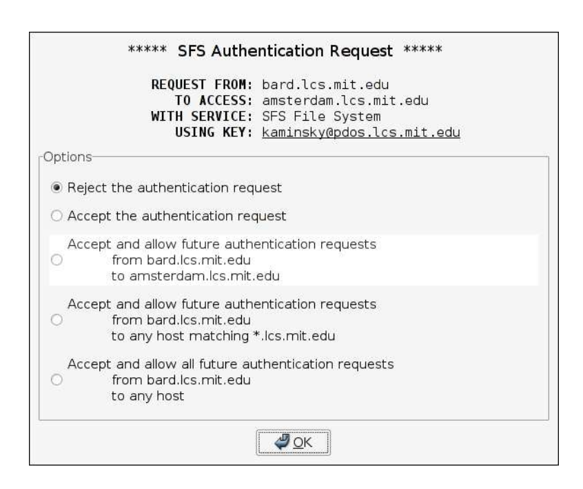
Figure 4: A GUI confirmation program

server" program, sfssd , can proxy TCP traffic to different internal IP addresses based on the contents of the initial CONNECT RPC. Port sharing with sfssd is similar to using the HTTP Host header with an HTTP proxy.