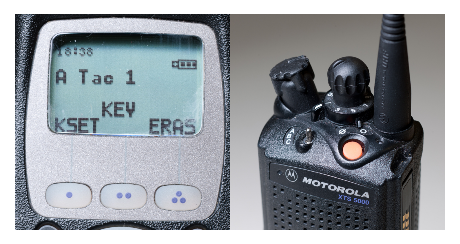
Figure 5: XTS5000 in "Clear" Mode