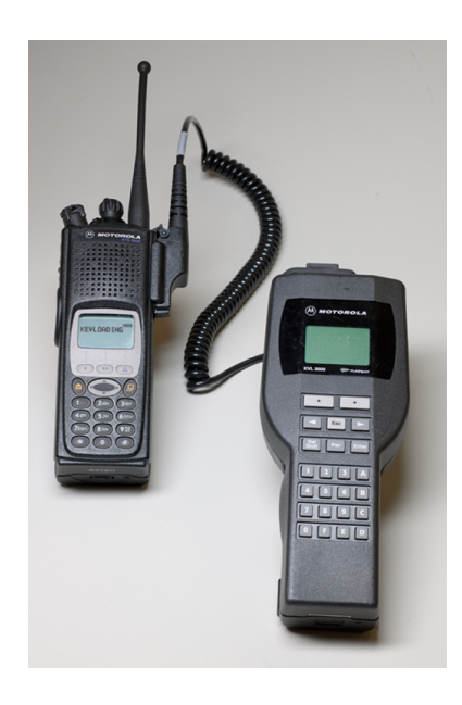
Figure 4: Motorola KVL3000 Keyloader with XTS5000 Radio

All models of P25 radios of which we are aware will receive any traffic sent in the clear even when they are in encrypted mode. There is no configuration option to reject or mute clear traffic. While this may have some benefit to ensure interoperability in emergencies, it also means that a user who mistakenly places the "secure"