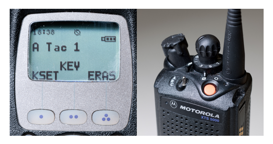
Figure 6: XTS5000 in "Encrypted" Mode

and defender. Whoever has the most power wins.<sup>7</sup>