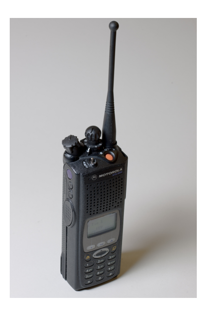
Figure 1: Motorola XTS5000 Handheld P25 Radio

P25 mobile terminal and infrastructure equipment is manufactured and marketed in the United States by