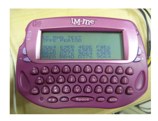
Figure 7: Girltech IMME, with modified firmware