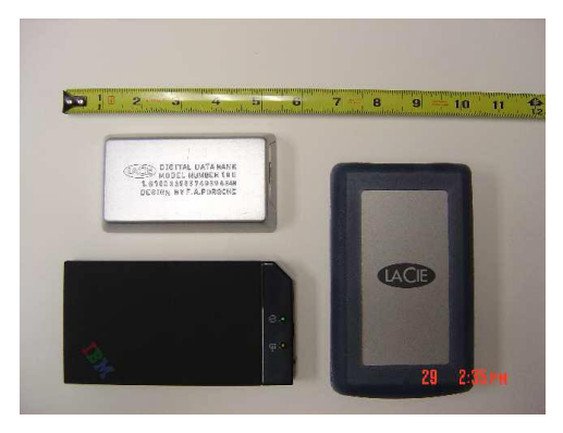
Figure 2: A sample of USB 2.0 portable disks used as SoulPads. Clockwise from upper left: LaCie 40GB DataBank, LaCie 60GB PocketDrive, and IBM 40GB Portable Hard Drive.

The user can suspend his session, then shut down the VMM layer and the Host OS, and walk away with his SoulPad . The user can later attach the SoulPad to a different EnviroPC , start the Host OS and the VMM layer, then load the suspended session state, resume it, and continue his session. If the user's tasks do not require network access, the PC may be completely disconnected from the network.